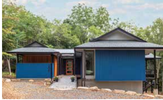
TOP AND BOTTOM: Blue corrugated metal paneling combined with Sherwin-Williams Knockout Orange on the front door give the exterior a punch. Branch continued the exterior color palette inside with her interior design. The trifold doors provide a seamless indoor-outdoor experience.